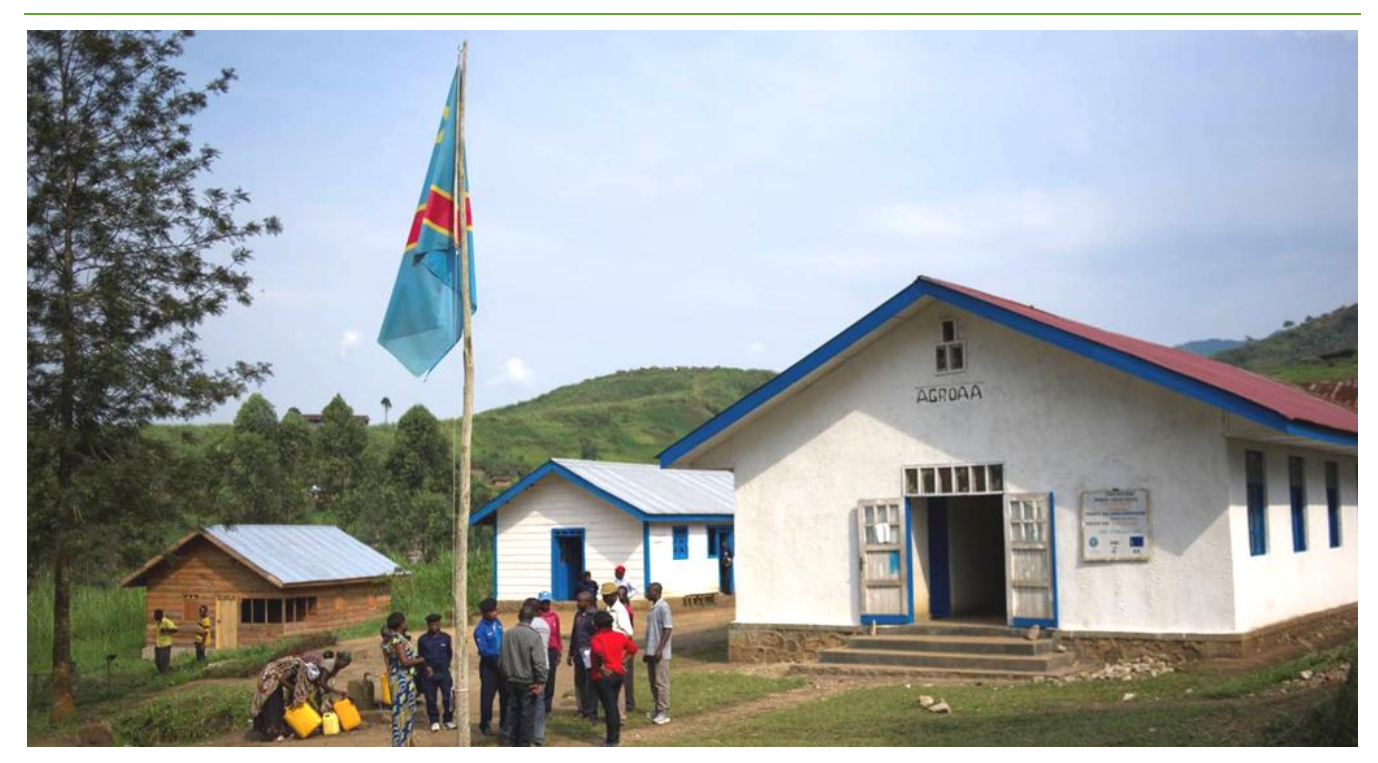
Local government office, Nyabiondo, Masisi territory, North Kivu.